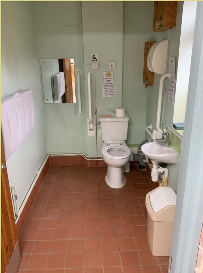
Picture of inside the accessible toilet.