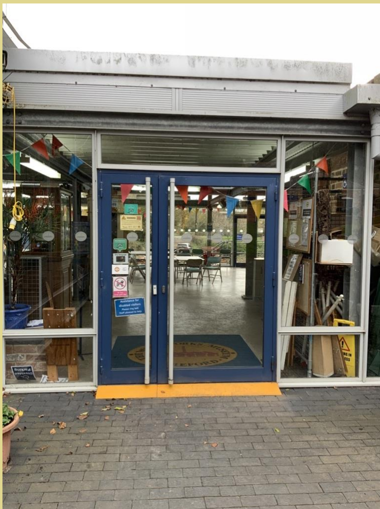
There is a level approach to the main entrance.