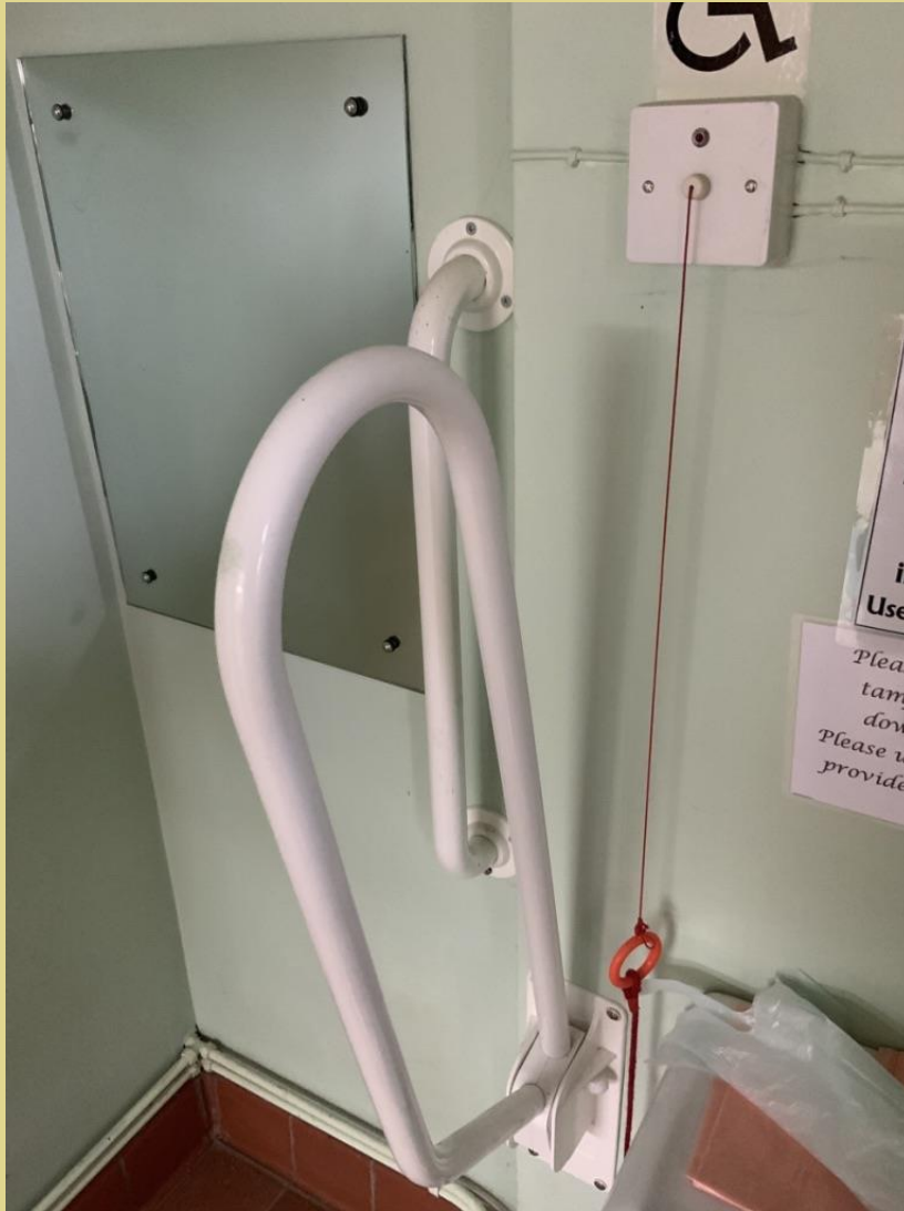
Grab rails are provided within the accessible toilet.