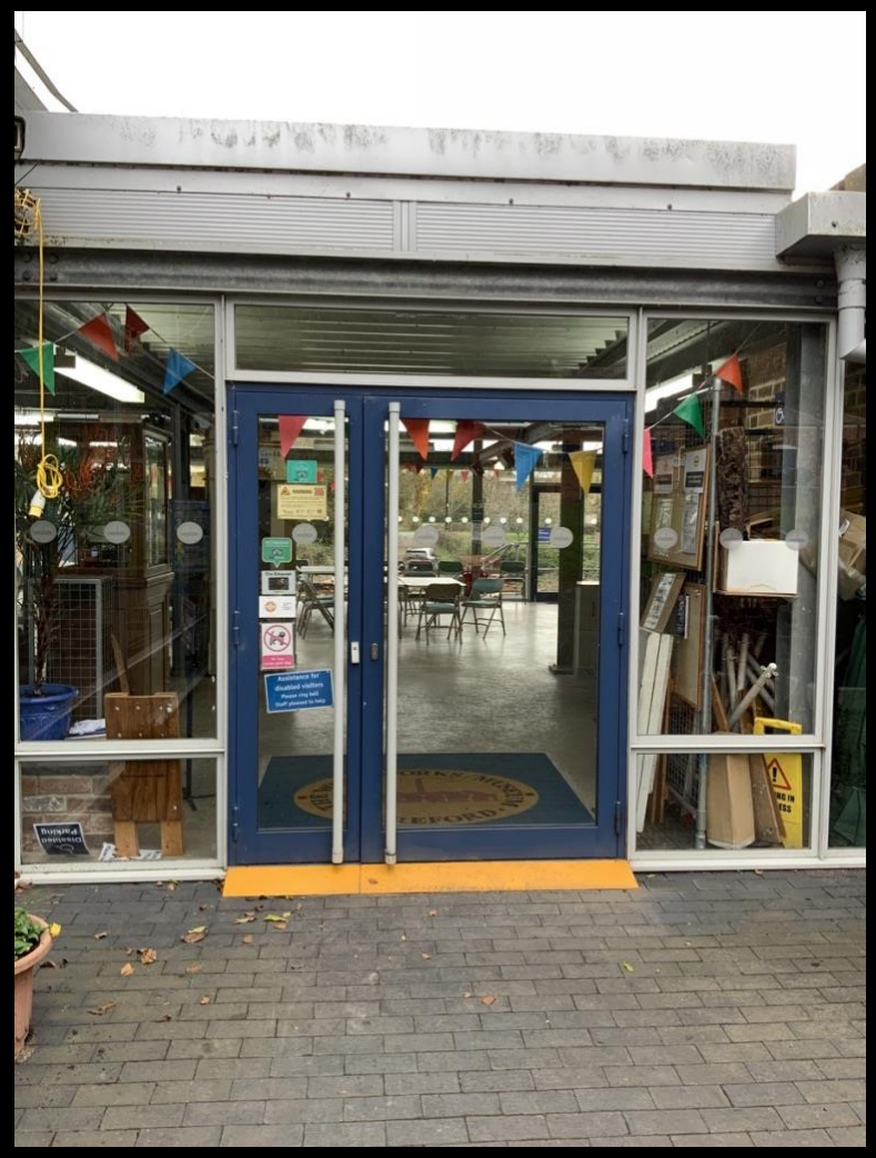
There is a level approach to the main entrance.