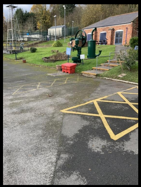
Accessible parking is provided.