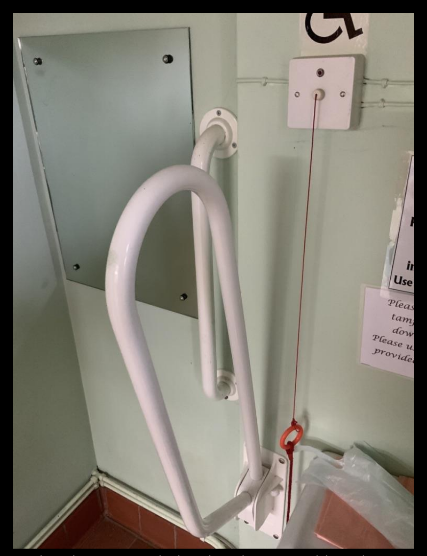
Grab rails are provided within the accessible toilet.