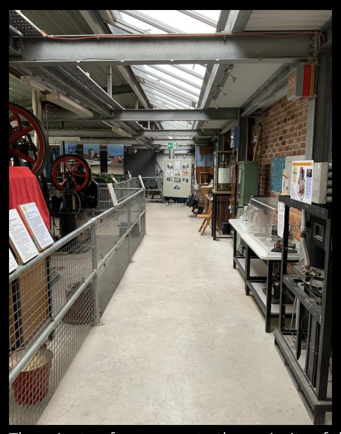
There is step free access to the majority of the museum.